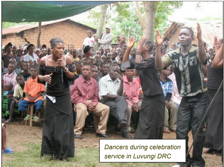
Dancers during celebration service in Luvungi DRC